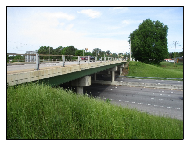
Photo 1 – S-32-273 (Bush River Rd.) Bridge over I-20 in Richland County, SC.

The existing bridge structure (~249.0'L x 79.5'W, inside curb to inside curb), is located on S-32-273 (Bush River Rd.) and crosses over I-20 in Lexington County, South Carolina. The bridge (SCDOT Bridge #327027300200) was constructed in the late 1970's according to the date on the original construction drawings. The bridge is a four-lane, four (4) span bridge constructed with poured-in-place concrete bridge deck spans, with concrete curb and gutters, and sidewalks, and galvanized guardrails. Each span is supported by eleven (11) steel beams with steel diaphragms. The steel beams are supported by two (2) end bents and